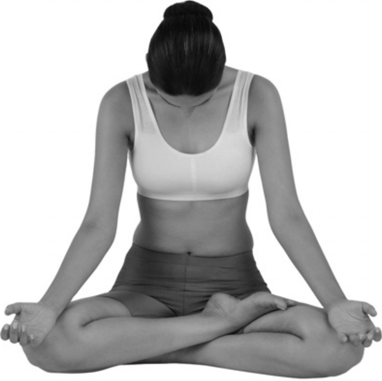
महाबन्ध – Mahabandha